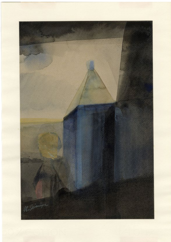
259. Morning 1988 28.2 × 19.1 cm Watercolor on paper Paste on the base paper Flamed