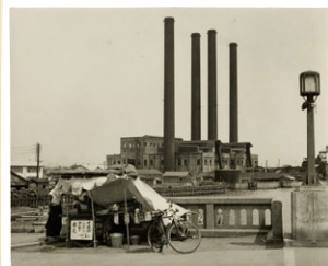
266. Arakawa 39.3 × 27.9 cm ed.100 Slight foxing Tape residue on margin With photo ¥35,000