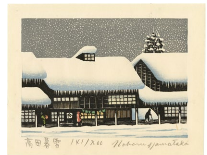
267. Twilight Snow at Takada 16.4 × 21.2 cm ed.200 Slight foxing on reverse ¥28,000