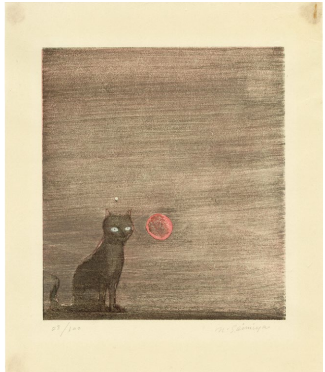
257. Sunset and Cat ¥680,000 1979 37.5 × 23.5 cm ed.100 Tape residue on margin Flamed