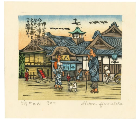
265. Botchan, Part Two 23.8 × 26.9 cm ¥25,000