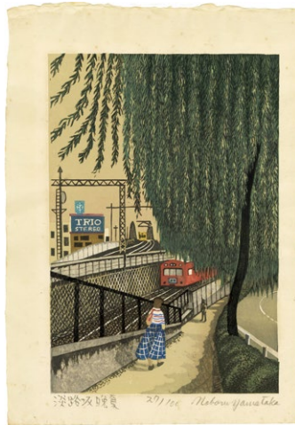
262. Late Summer at Awaji Hill 40.2 × 27.8 cm ed.100 Foxed ¥25,000