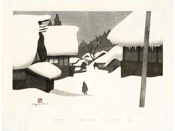
271. Mishima Town, Oishida, Winter in Aizu(62) ¥520,000 1986 45.8 × 60.8 cm ed.100 Flamed (Sealed) Slight browning