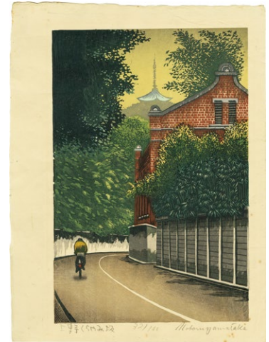
263. Kurayami Slope in Ueno 1973-91 37.7 × 28 cm ed.100 Foxed ¥25,000