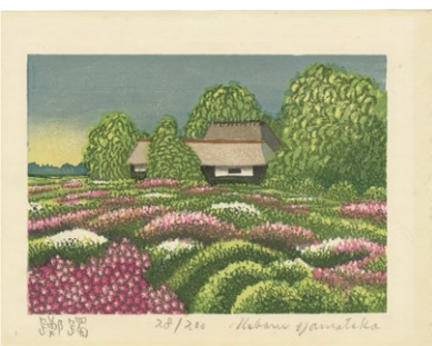
268. Azalea 17 × 21.9 cm ed.200 Slight soiling on margin Tape residue on margin ¥20,000