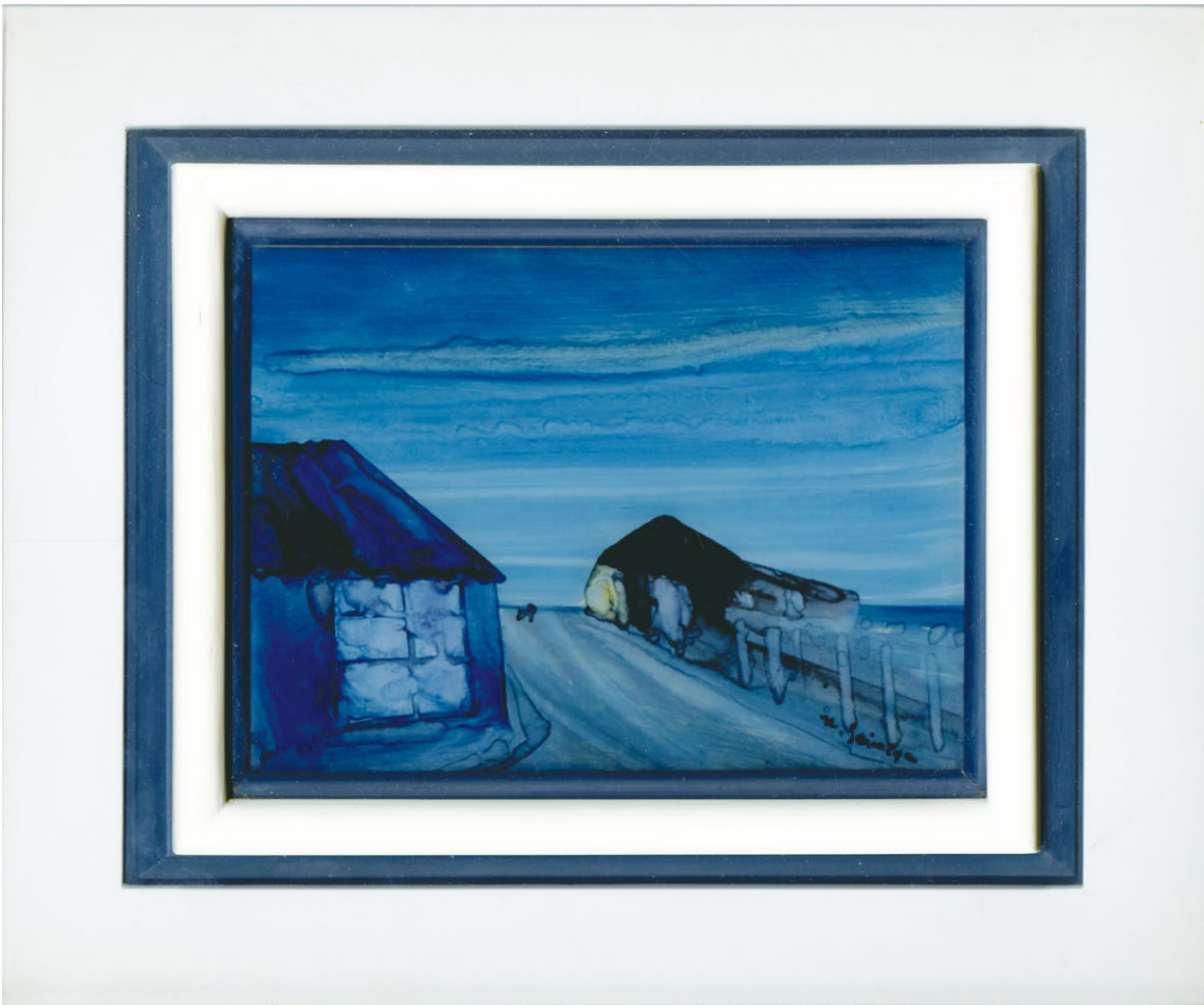
258. The Road to the Sea 1972 14 × 17.5 cm (Picture size) Painted on glass Framed (Sealed)