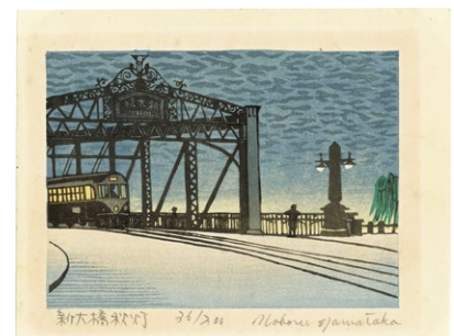
269. Autumn Lights at Shin-Ohashi 16.9 × 21.9 cm ed.200 Soiled Foxed ¥15,000