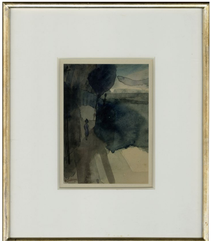
260. Autumn's Cut-through 1973 17.9 × 13.1 cm Watercolor on paper Slight foxing Flamed (Sealed)