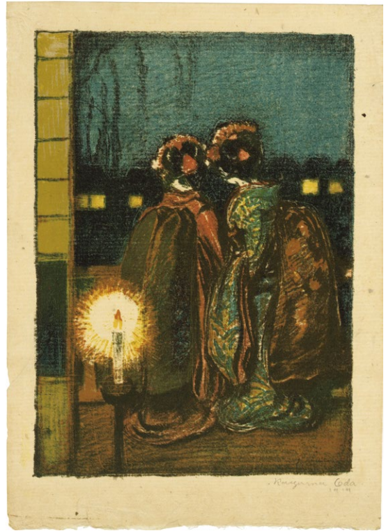
255. Night View of the Kamo River ¥140,000 1919 30.2 × 21.5 cm (ed.45) Lithograph