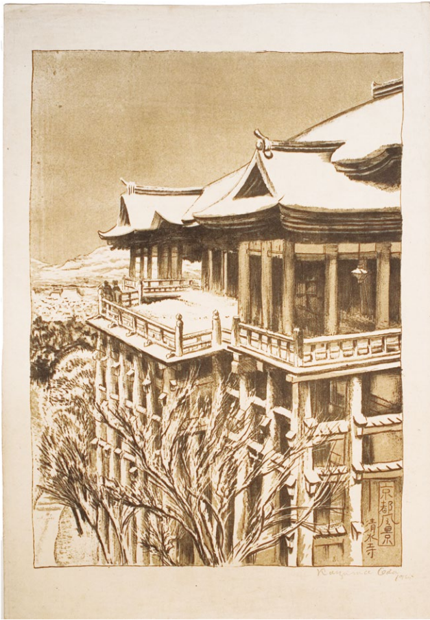
254. Kiyomizu Temple, Kyoto Scenery ¥200,000 1925 48.3 × 33.6 cm (ed.30) Lithograph