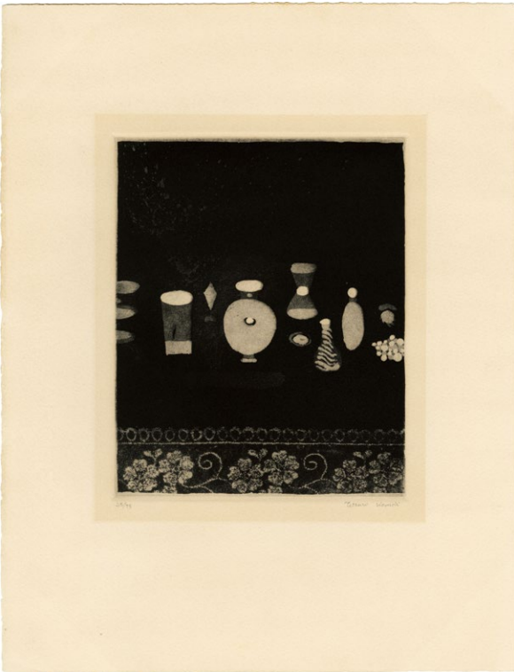
270. Nature Morte ¥450,000 1975 18 × 15 cm ed.75 Aquatint · Soft ground etching Lightly mat line