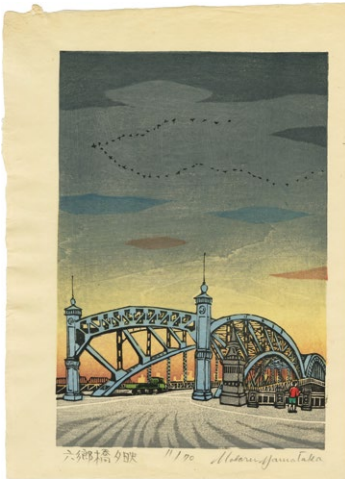
261. Sunset Reflection at Rokugo Bridge 38 × 28 cm ed.70 ¥45,000