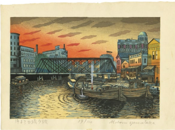
264. Sunset Reflection at the Old Yorohi Bridge 27 × 37.7 cm ed.100 ¥45,000