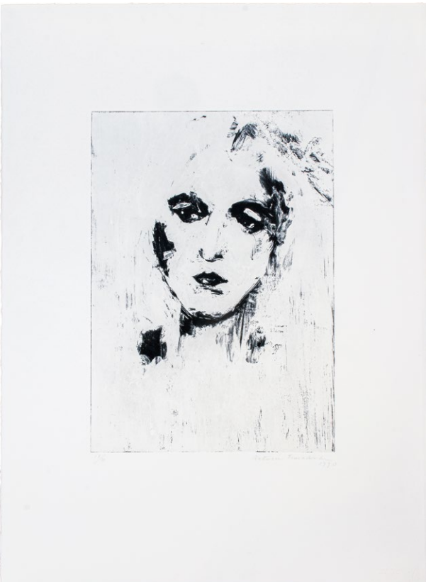
272. The Book Half Read ¥250,000 1990 39.7 × 29.8 cm (Picture size) ed.30 Soap ground etching · Drypoint Framed