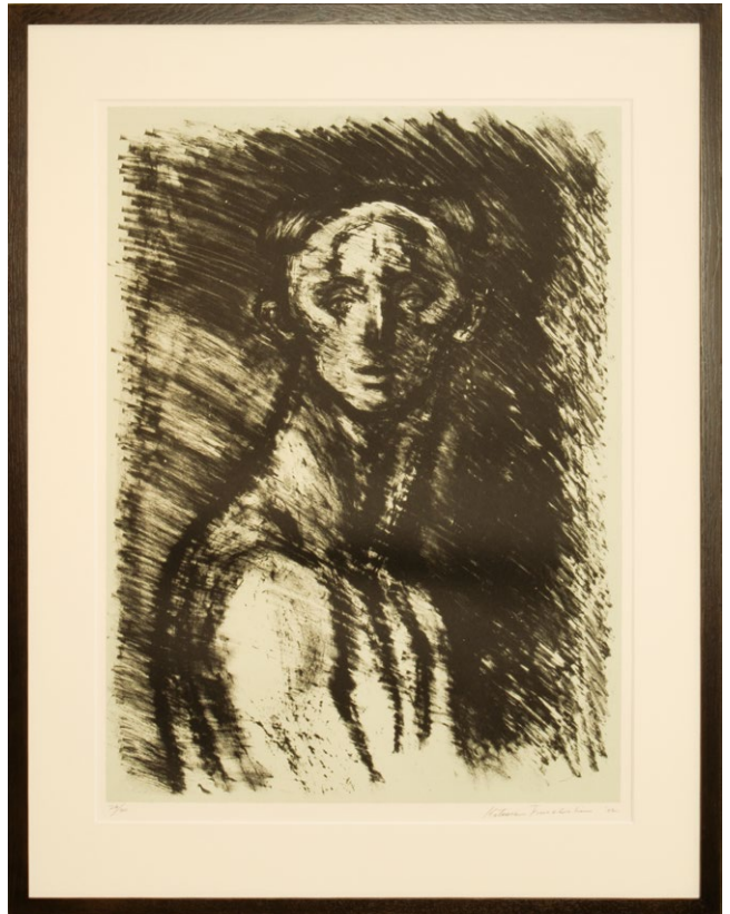
273. Panther Going Back to the City ¥240,000 2002 81.7 × 62.3 cm ed.40 Lithograph Framed