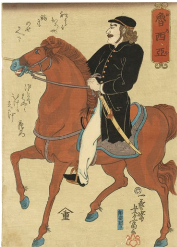
104. Russian ¥55,000 1860 Restored small wormholes Slight browning