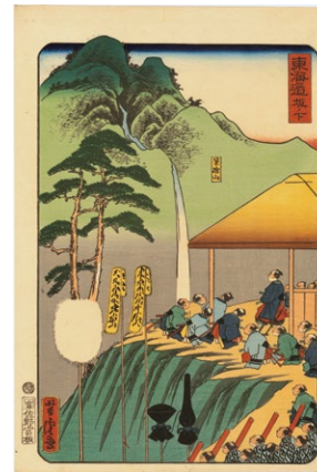
94. Sakanoshita ¥25,000 Slight browning on margin