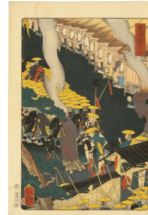
101. Hodogaya ¥25,000