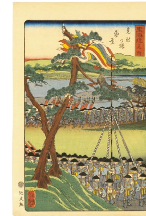
102. Mitsuke ¥25,000