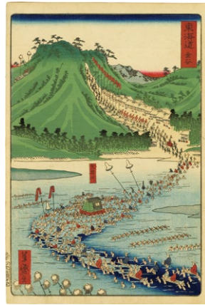
98. Kanaya ¥24,000 Slight browning Backed