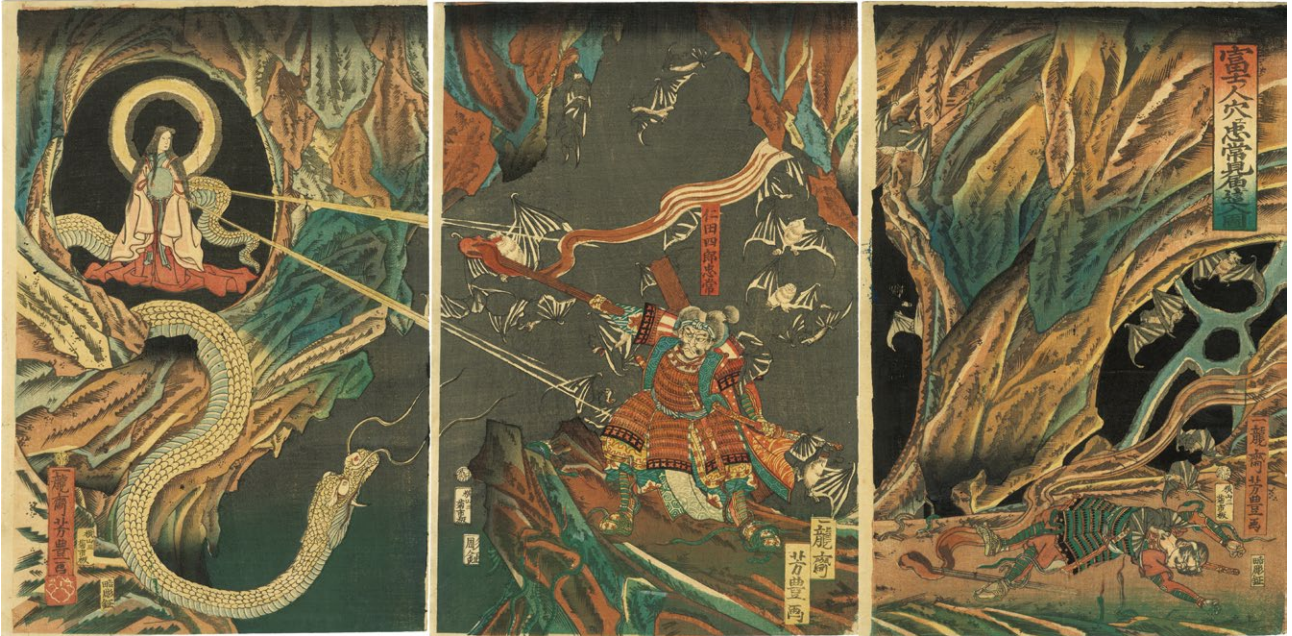
90. Tadatune Crawling into the Cave of Mt. Fuji 1862 Small wormholes