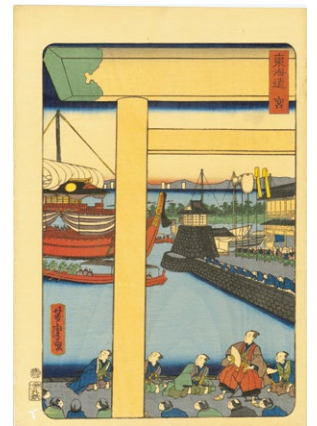
95. Miya ¥31,000 Small wormholes on margin