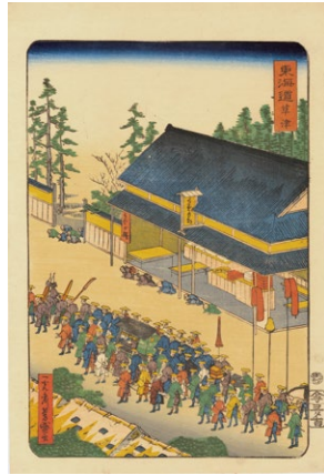
97. Kusatsu ¥25,000 Very good impression