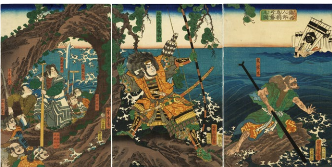
93. Chinzei Hachiro Tametomo in an Archery Stance 1861 Slight browning Restored small wormholes Very small wormholes Paper remnants on reverse ¥130,000