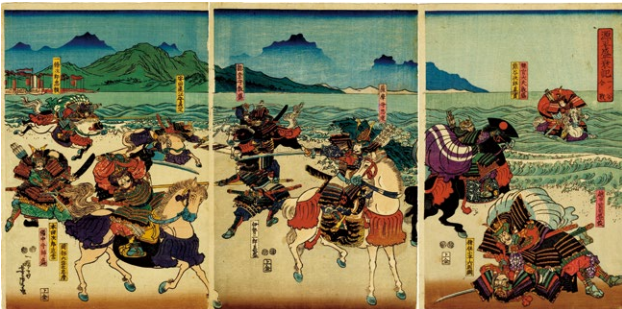
91. Battle of Ichinotani, Rise and Fall of the Minamoto and the Taira Clans 1847 - 52 Slight browning ¥70,000