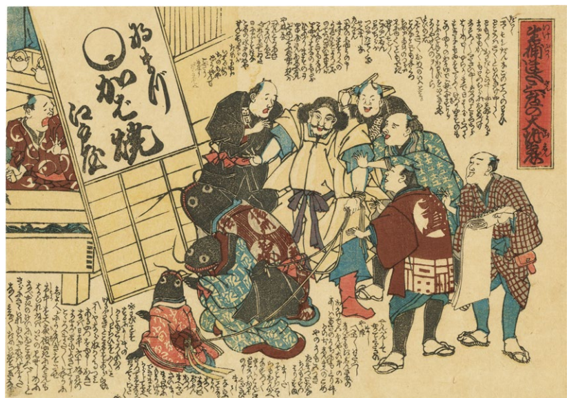
105. 3 Great Earthquakes and the Catfish That Caused Them ¥120,000 1855 Backed Restored small wormholes Slight browning