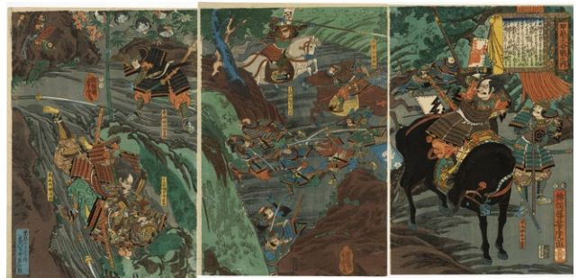
92. Great Battle of Koetsu 1847 - 52 Backed Restored small wormholes