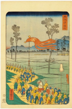
96. Hamamatsu ¥25,000 Very good impression