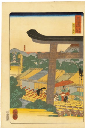
100. Great Shrine of Atsuta's Torii Gate Very good condition Slight soiling ¥31,000