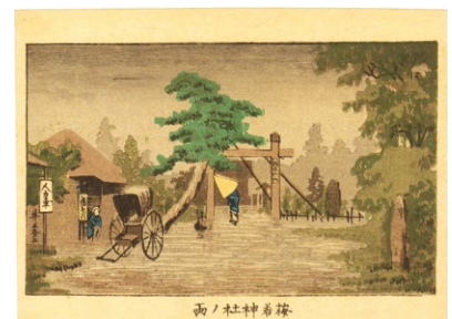
112. Rain at Umewaka Shrine Ko-ban ¥14,000