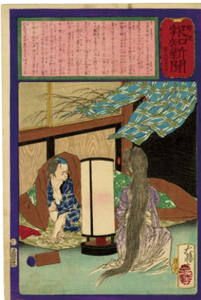
123. No 527, Postal News 1875 Slight browning ¥40,000