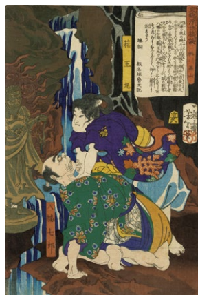
151. Hakoohmaru, Tales of the Floating World on Eastern Brocade c. 1867 Lightly backed ¥50,000