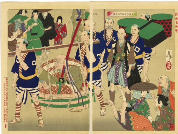
121. Okubo Hikozaemon Carried to the Shogun's Castle in a Tub, New Selection of Eastern Brocade Prints 1886 Slight browning ¥100,000