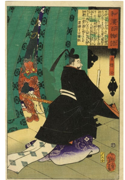
132. Lord Sadanobu ¥200,000 Slight browning Restored small wormholes