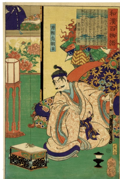
143. Minamoto Raiko Ason Browned Very small wormholes ¥180,000