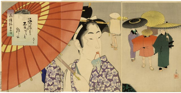
108. The An'ei Era, Floral Patterns ¥40,000 1896 Backed Joined together