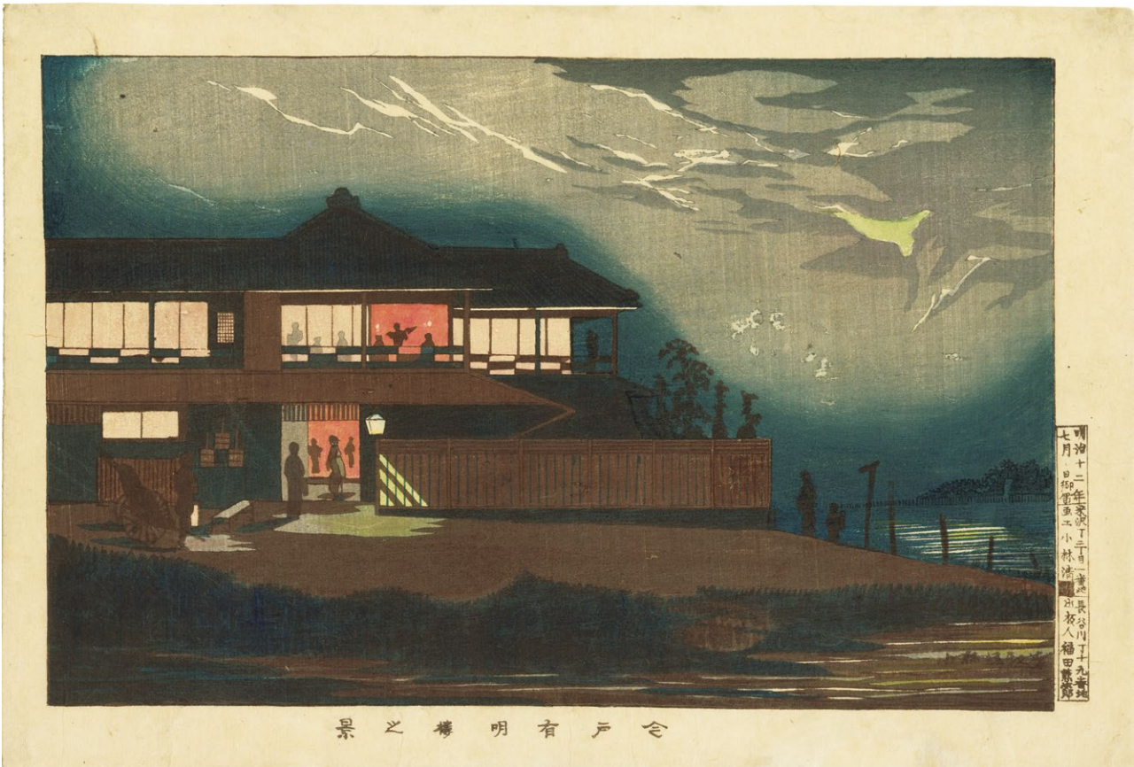
106. View of the Ariakero Restaurant at Imado 1879 Slight browning