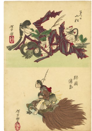
126. Urashima Returning on the Turtle Browned ¥35,000