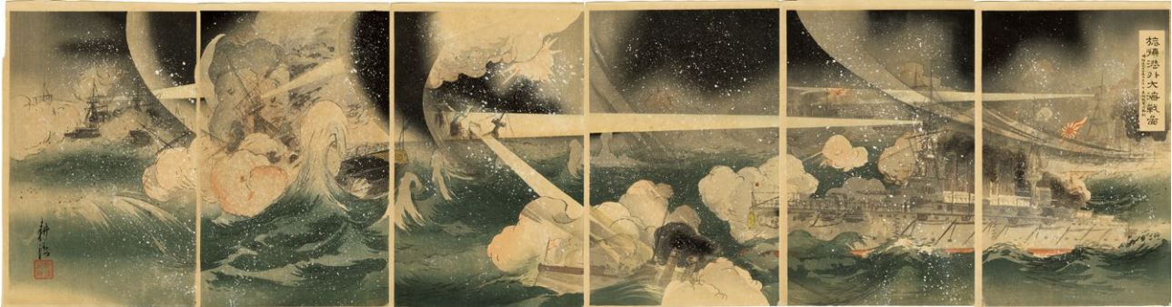
120. Depiction of the Great Naval Battle off Port Arthur 1904 Continuity of 6 images Slight soiling ¥120,000