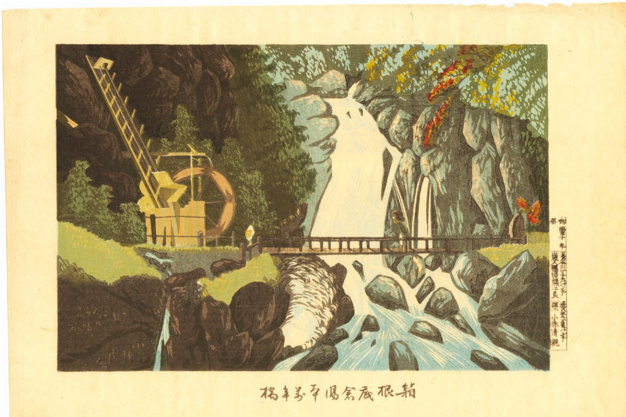
107. Mannen Bridge at Sokokura Yumoto, Hakone 1881 Slight browning on margin Side fold