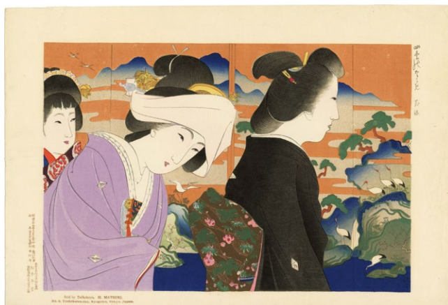
114. Bride, Scenes of the 4 Seasons 1906 ¥70,000