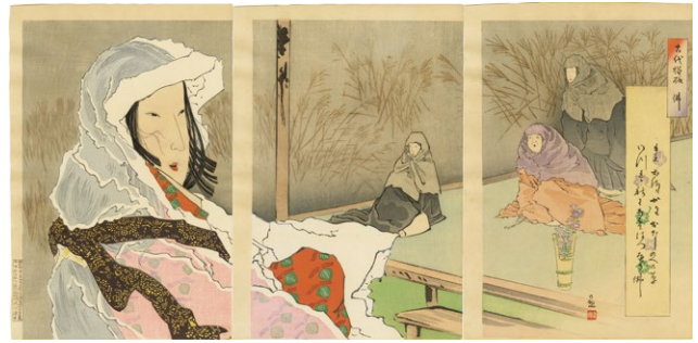
109. Hotoke Gozen, Ancient Patterns ¥50,000 1897 Slight soiling Slight browning