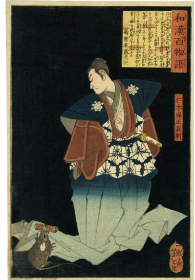
138. Nikki Danjo Naonori ¥200,000 Slight browning Restored small wormholes