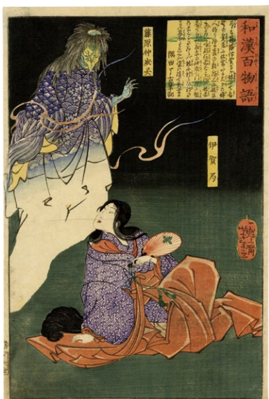
134. Iga no Tsubone ¥200,000 Browned Creased Slight thinning