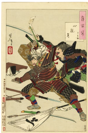
146. Moon's Inner Vision 1886 Backed Slight browning ¥70,000