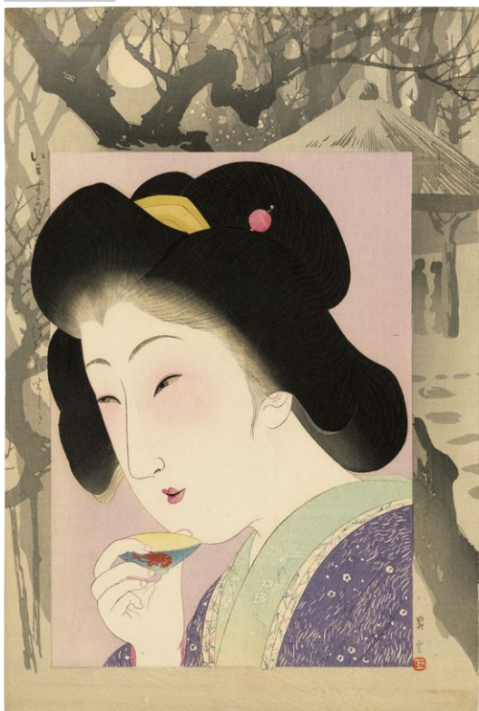
113. Detached Seating Area, Lady in Modern Style (1907) Slight browning ¥100,000