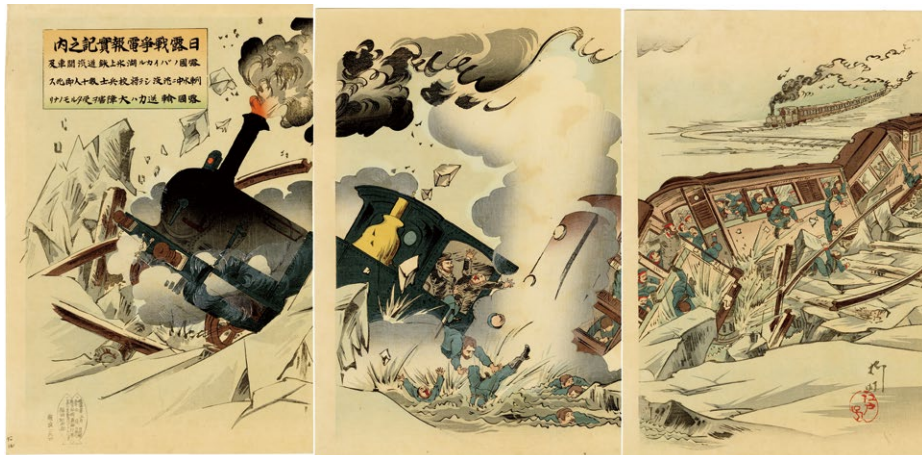
118. True Record of Telegraph Reports from the Russo-Japanese War ¥55,000 1904 Slight browning Small notations on margin