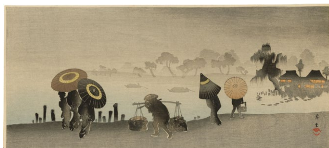
115. Umbrella on the Riverbank c. 1900 - 12 O-tanzaku ¥70,000