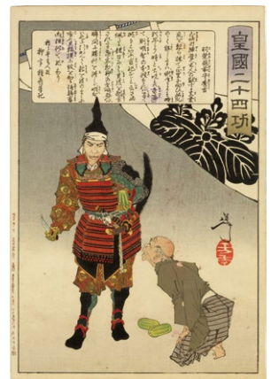
149. Hashiba Chikuzen no Kami Hideyoshi, 24 Accomplishments in Imperial Japan 1893 Slight browning ¥22,000