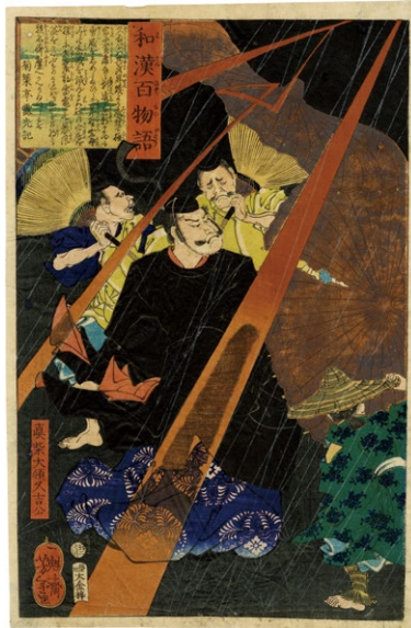
137. Mashiba Dairyo Hisayoshi Slight browning Restored small wormholes ¥200,000