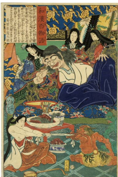
133. Shutendoji ¥200,000 Browned Restored wormholes