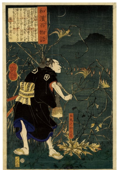
135. Samanosuke Mitsutoshi ¥200,000 Restored wormholes