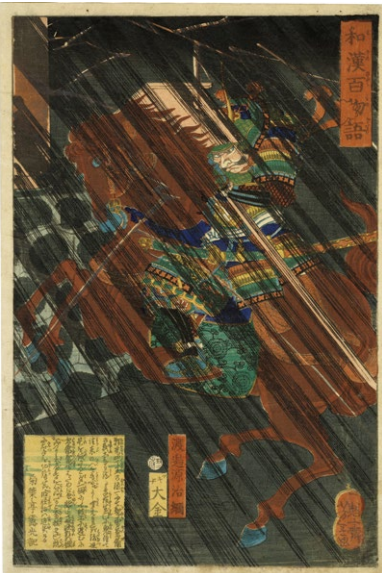
139. Watanabe no Tsuna ¥200,000 Slight browning Rubbed Restored small wormholes