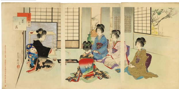
116. Tea Ceremony, Modern Custom Authority ¥60,000 1899 Slight browning Centerfold on right part