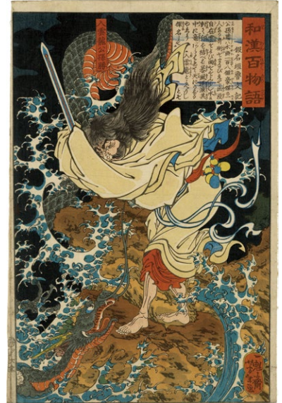
129. Kon Sosho ¥220,000 Slight browning Side fold