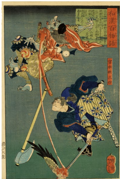
131. Miyamoto Musashi ¥240,000 Slight browning