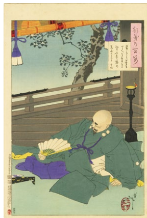
147. Geni Composes a Poem in Moonlight 1887 Backed ¥60,000