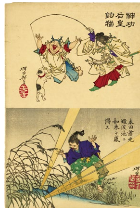
125. Empress Jingu Fishing for a Cat Slight browning ¥38,000