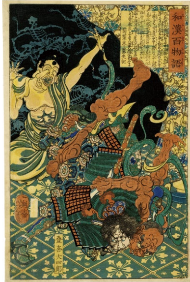
128. Toki Daishiro ¥240,000 Slight browning Restored small wormholes