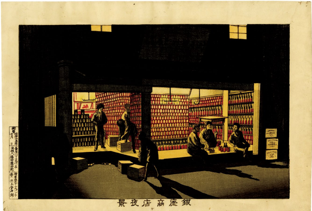
110. Nightscape of Ginza Shops 1882 Very good impression & condition Slight browning on margin ¥2,000,000