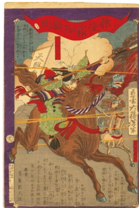
124. No. 1127, Postal News 1876 Centerfold Binding holes ¥30,000