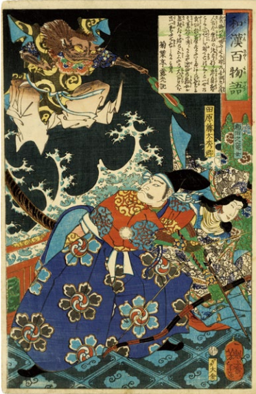
127. Tawara Tota ¥280,000 Slight browning