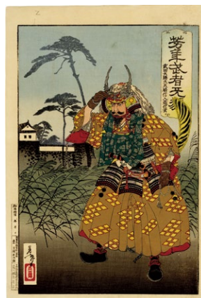
152. Takeda Shingen in Armor Walking by Castle, Courageous Warriors 1885 Backed Slight browning Small notations ¥75,000