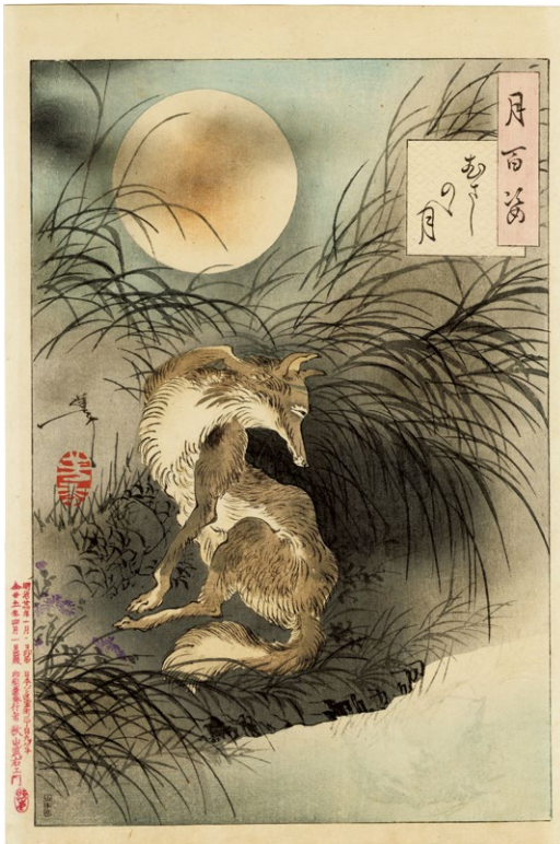
144. Musashi Plain Moon 1891 ¥500,000