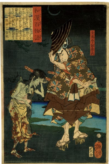
142. Suma Urabe Suetaka Browned Restored wormholes ¥180,000