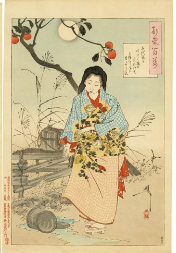
145. Lady Chiyo and the Water Bucket 1889 Slight browning Set with Key-block Outlines print Foxed & Small wormholes on key-block print ¥150,000