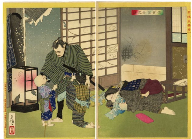
122. Sakura Sogo Leaving His Family, New Selections of Eastern Brocade Pictures 1885 Browned ¥100,000