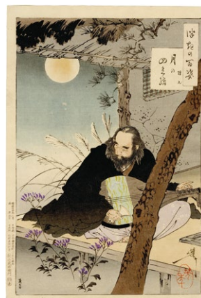
148. Moon's 4 strings 1891 Restored wormholes on margin ¥70,000