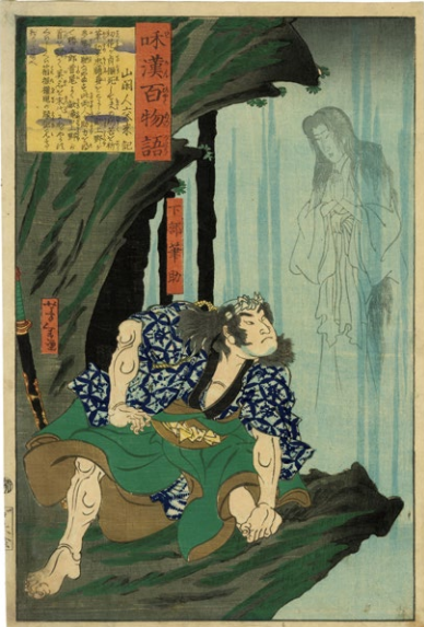
136. Fudesuke ¥240,000 Restored small wormholes Slight browning