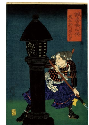
153. Chikamatsu Kanroku Minamoto no Yukishige Behind a Stone Lantern, Seichu Gishinden 1868 Restored small wormholes ¥200,000