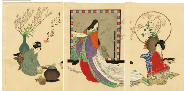
117. Elegant Women Competing Among the Spring Flowers 1898 Very good impression & condition Slight foxing ¥45,000