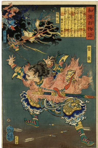
140. Raishin ¥200,000 Slight browning Backed