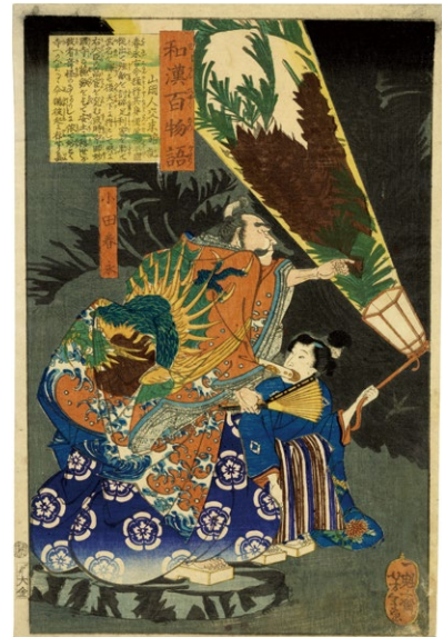
141. Oda Harunaga ¥200,000 Slight browning Restored small wormholes