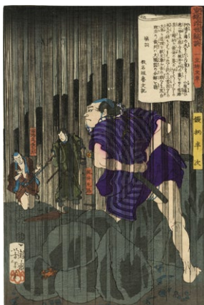
150. Kotegara Hanji, Tales of the Floating World on Eastern Brocade 1867 Slight soiling ¥68,000