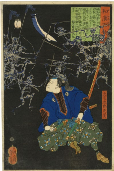
130. Taro Mitsukuni ¥280,000 Slight browning Restored small wormholes